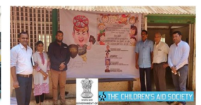
Govt. of Maharashtra

Project for Juvenile Offenders (Criminals) & Non-Offenders with Jamil Meusen (Police Commissioner) and other Govt. officials from the Netherlands.