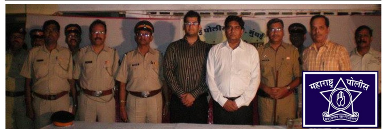
Maharashtra State Police

Cricket Match Organised between Crime beat Media of all top companies with Mumbai Police Force One Commandos (Counter-Terrorism Unit)