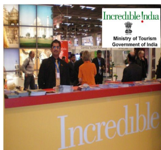
Ministry of Tourism, Incredible India

Global Tourism Event in Gothenburg, Sweden Participation with Government of India to promote Tourism.