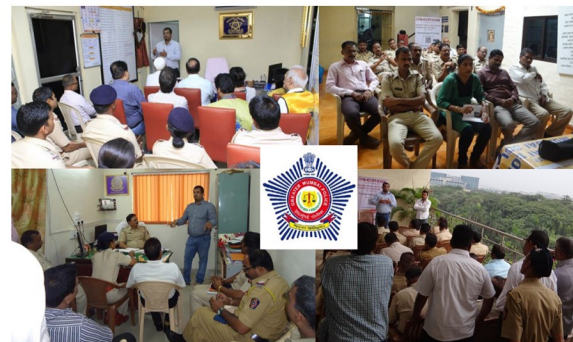
Crime Intelligence sessions for Metropolitan City - Mumbai Police

Panel Speaker with Jt. Secretary, National Security Council Secretariat, Govt. of India & others