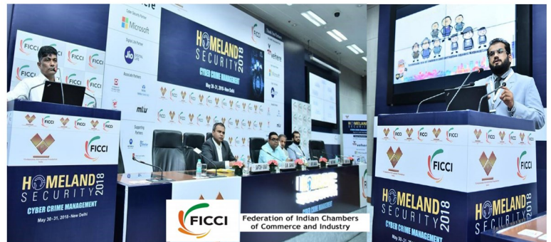
Homeland Security Conference attended by Indian Defence Forces and other policing officials

Opening Session Speaker for Predictive Policing Conference