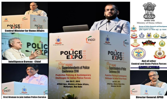
Bureau of Police Research & Development Conference, Govt. of India

Opening Session Speaker for Predictive Policing Conference