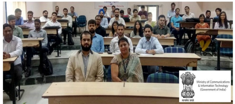
Ministry of Communications, Dept. of Telecom, Govt. of India

Law & Order techniques provided along with spot psychological evaluations for ongoing case of their respective police stations.