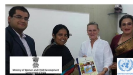
Ministry of WCD (India)

Global Tourism Event in Gothenburg, Sweden Participation with Government of India to promote Tourism.