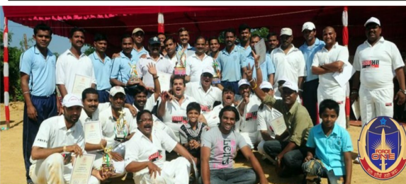
Mumbai Police Commandos & Media

Latest Trends in Cyber Crime Training for officials at 'Center for Development of Advanced Computing' (C-DAC) by Ministry of Electronics & Information Technology, Government of India.